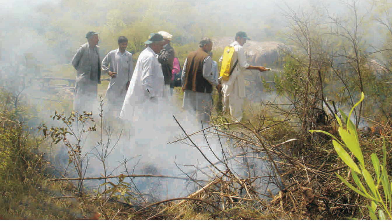
Continued on page 3

Deployed along the vast and largely uninhabited stretches of the country's eastern border, Punjab Rangers play a significant role in the conservation of forests, wildlife, and wetlands. In this regard, the ban